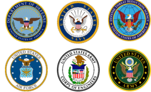
(A Representative Sampling)

VIRSIG is a non-traditional construction and technology General Contractor. Our solutions are tailored to meet your unique needs and keep you focused on your mission. We offer a wide range of services including technology solutions , professional services , construction , and specialty procurement to provide comprehensive solutions, so you can focus on what matters most.