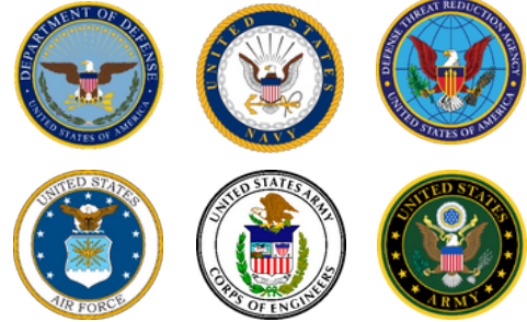
(A Representative Sampling)

VIRSIG is a global solutions provider. Our solutions are tailored to meet your unique needs and keep you focused on your mission. We offer a wide range of services including technology solutions , professional services , construction , and specialty procurement to provide comprehensive solutions, so you can focus on what matters most.